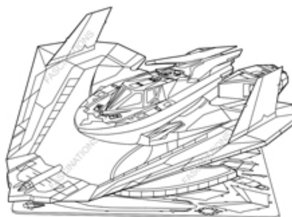
Batman V Superman Batwing Item No. MMS376